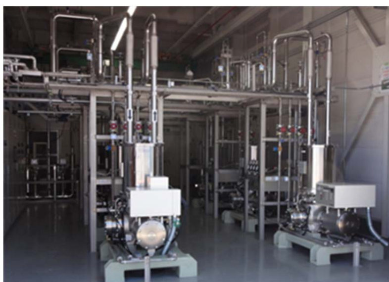
Fig. 1 Cooling system for HTS cable demonstration trials

The cooling system for the HTS cable comprised of a refrigerator, a circulating pump and a reservoir tank equipped with a pressure control device (Figure 1). The HTS cable was cooled continuously by circulating sub-cooled liquid nitrogen, taking into consideration the homogeneous cooling and electrical insulation attributes of the cable. Each component was selected by its track record and choices being, a 1kW-class Stirling cycle refrigerator and a centrifugal circulating pump. A total of six refrigerators and two circulating pumps were employed after contemplating variations in thermal loss and redundancy of HTS cables. An unattended demonstration of the HTS cable system were conducted at the Asahi Substation of the Tokyo Electric Power Company with remote supervision of the operational status of both liquid nitrogen and every component, sending warnings to substation monitoring centers and project managers of any impending issues.