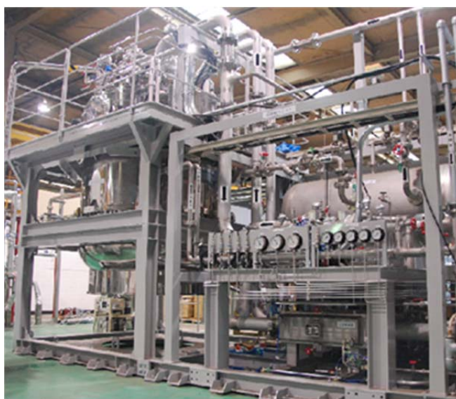
Fig. 2 5kW-class Brayton cryocooler planned for demonstration trials at the Asahi Substation

The current project concluded in February 2014. The next project phase currently planned at the Asahi Substation for the 5kW-class Brayton Cryocooler involves demonstration trials to be conducted for more than a year. Successful outcomes from this phase of the project will ultimately lead to the potential application of HTS cables into grid system. Thus, the author and her team hope for a positive outcome.